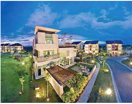
Our consultancy, feasibility and valuation skills cover a wide range of services...